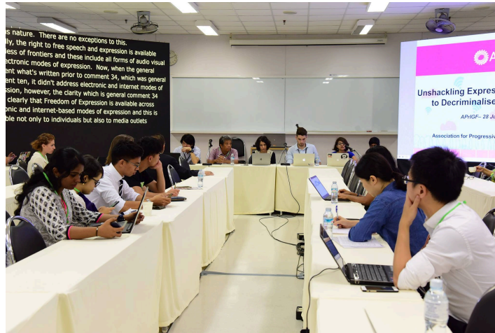
APrIGF 2017: live scribe screen on the left