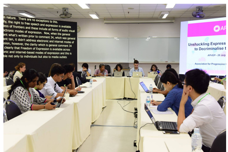
APrIGF 2017: live scribe screen on the left