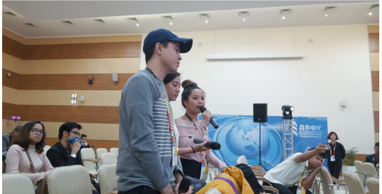
Participants contributing to the synthesis document during the Synthesis Document Townhall Session