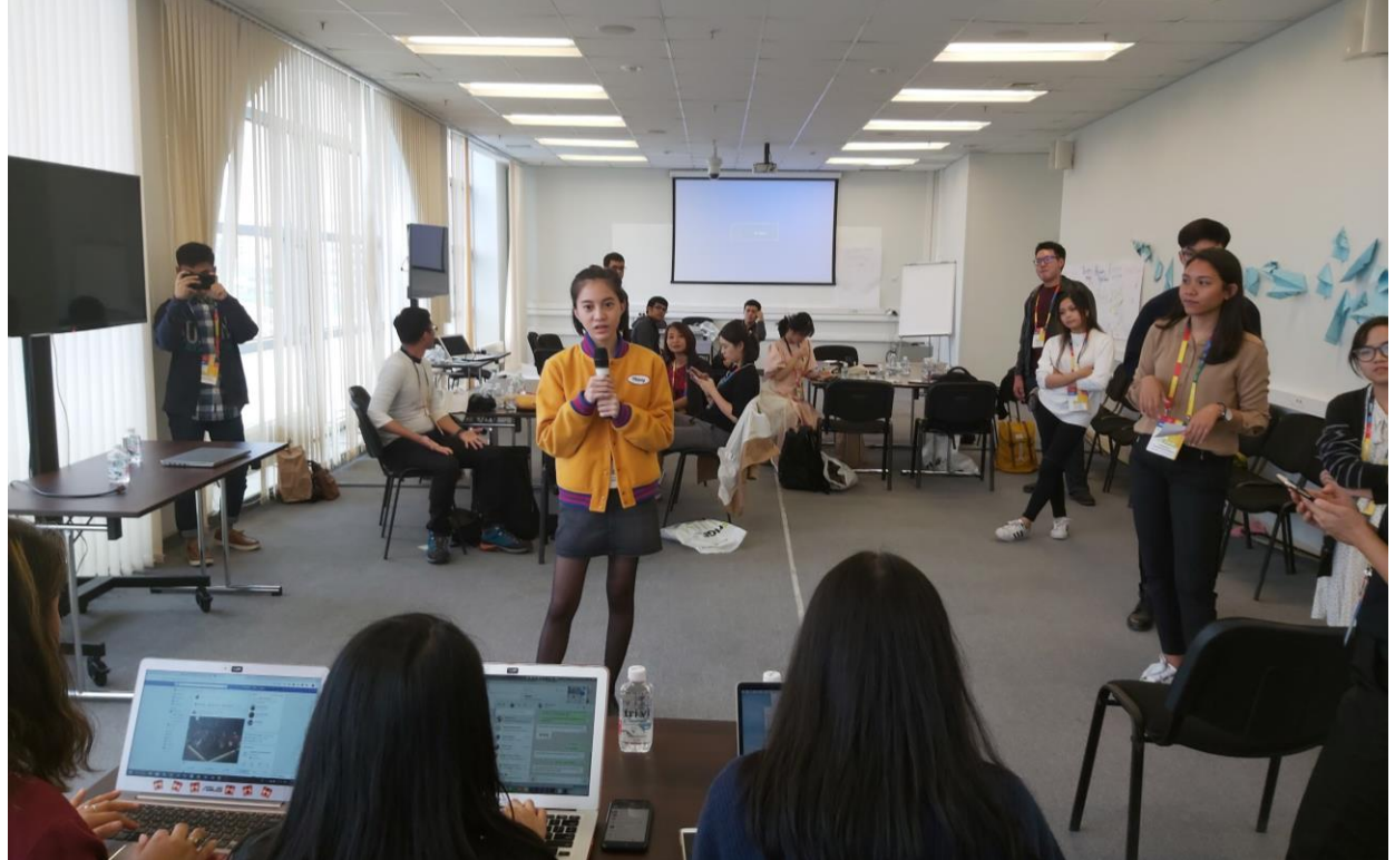
Participant speaking up during the Idea Wall x Mini Townhall session.