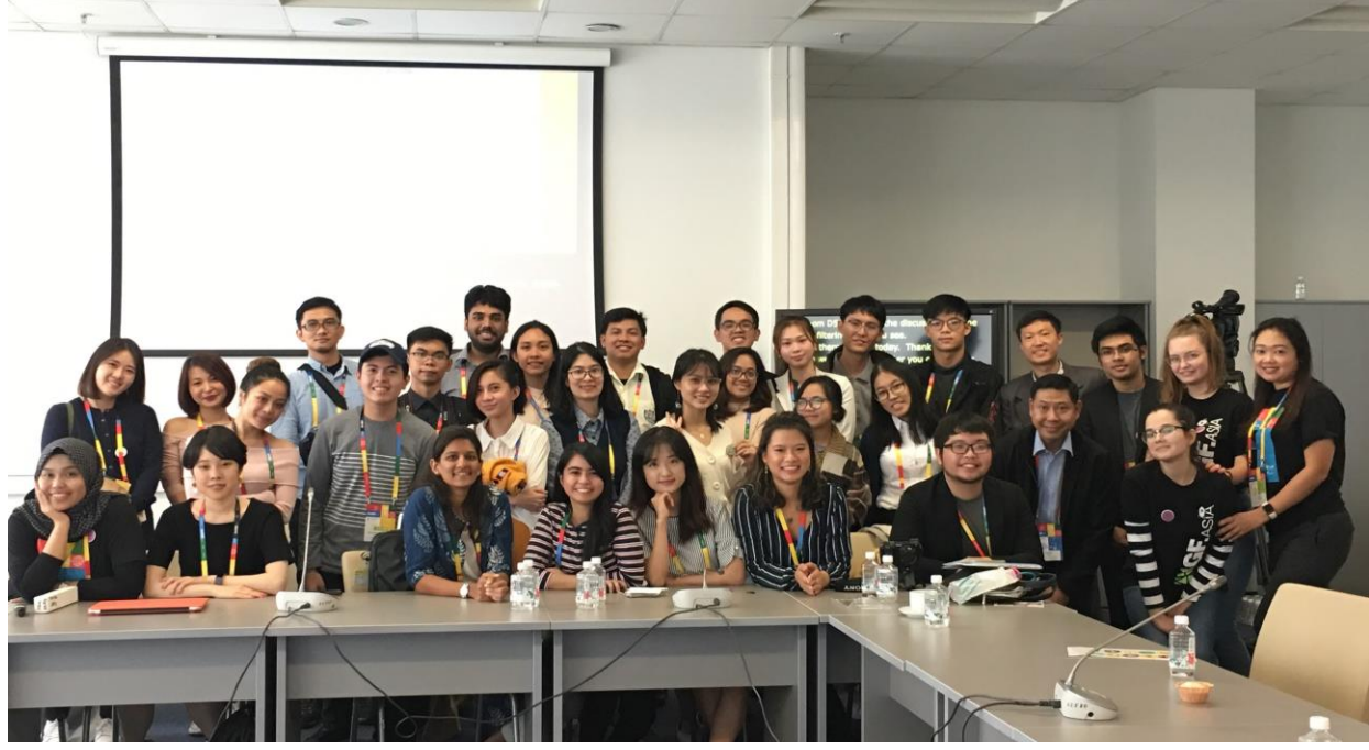
All of our youth participants have joined an youth-oriented workshop at APrIGF 2019