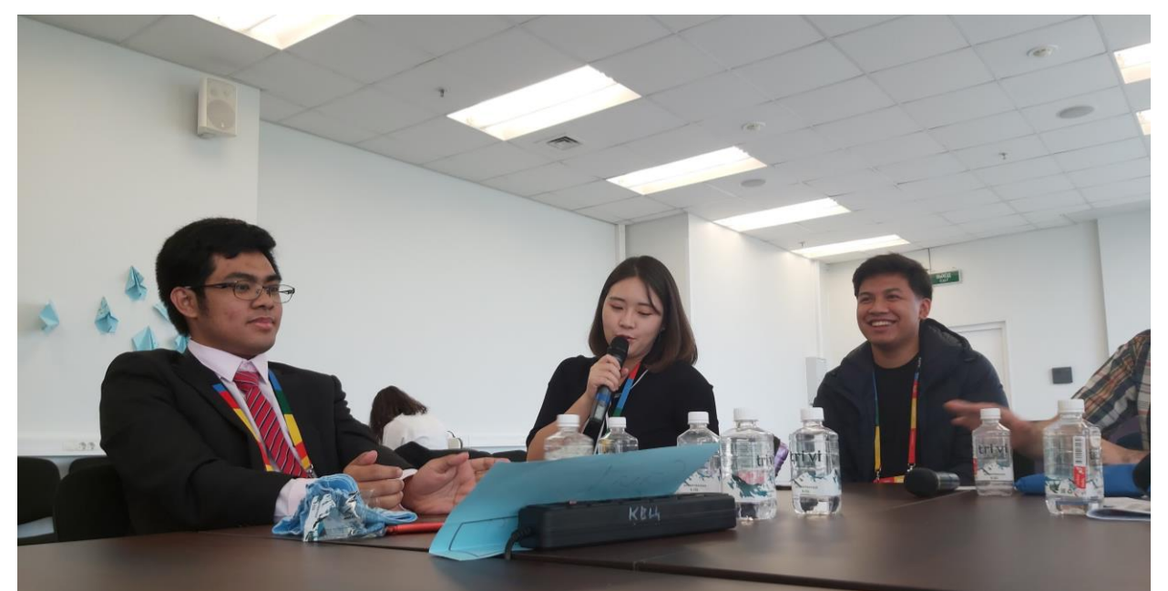
Participants expressing their opinions representing the civil society during the role-play discussion