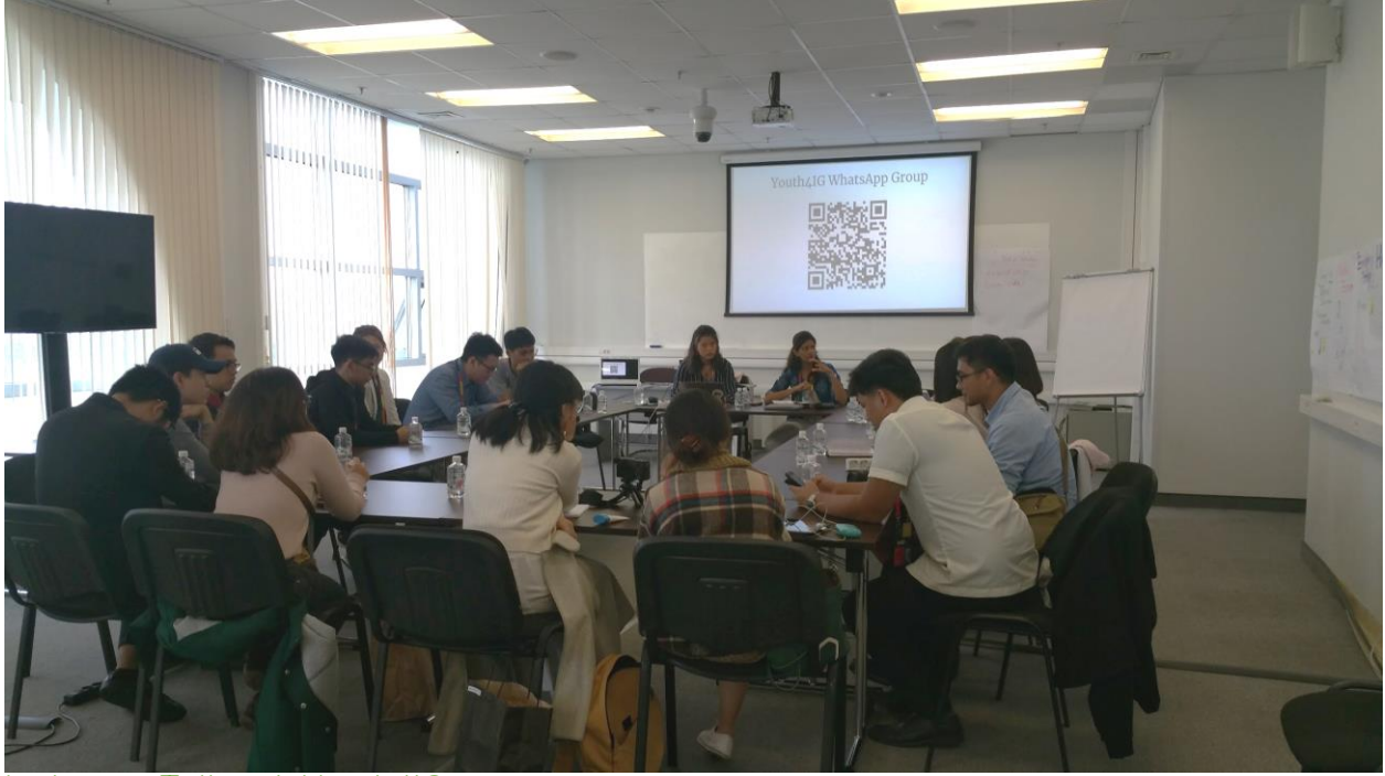
Lightning Talk with Youth4IG