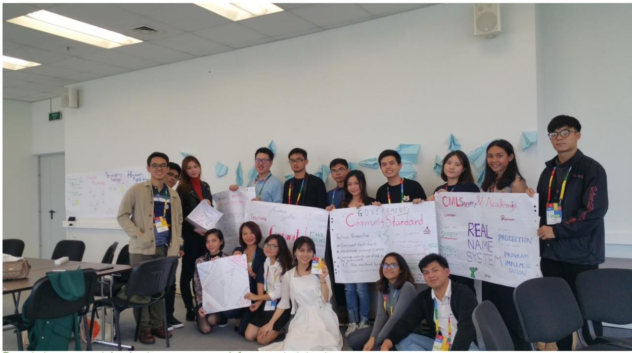
Participants with their presented future initiatives