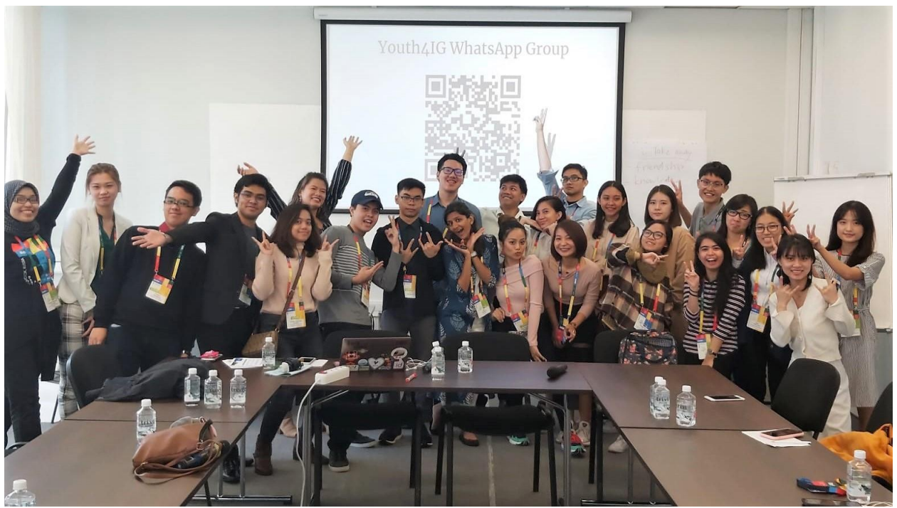
Our youth participants have contributed new ideas to the guidelines of the mentorship program of Youth4IG

Ideas of holding awareness raising activities such as workshop for youth in their home country were raised by participants. Part of the participants from Vietnam would use their experience gained from yIGF 2019 to host their own yIGF in Vietnam next year. Some of them added that they, as individuals, would share more information on Internet issues and Internet governance among their social circles.